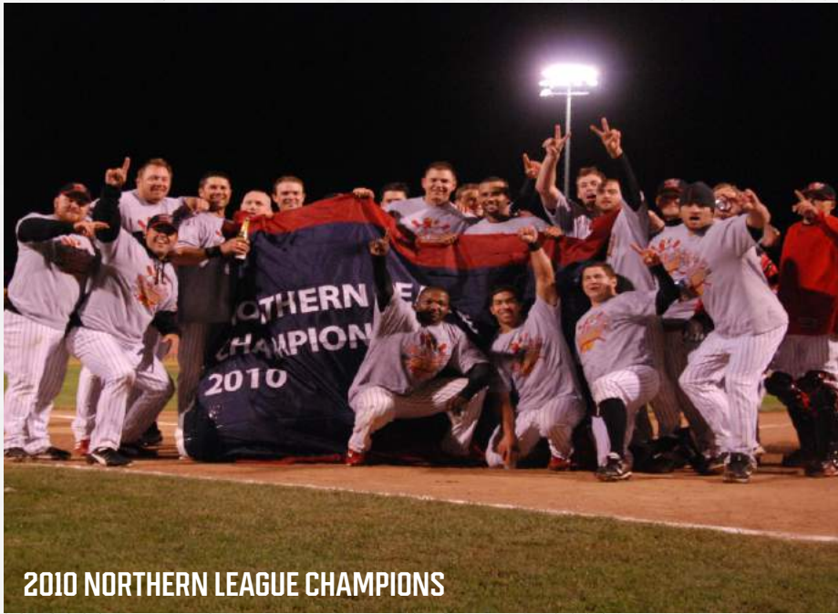
2010 NORTHERN LEAGUE CHAMPIONS