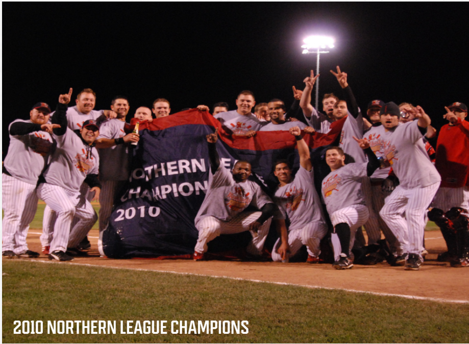
2010 NORTHERN LEAGUE CHAMPIONS